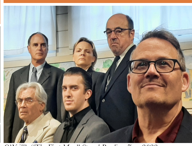
O'Neill's "The First Man" Staged Reading, Jan. 2023