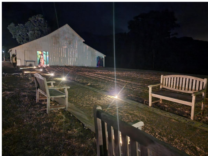
The Old Barn during a night-time performance of "Anna Christie"