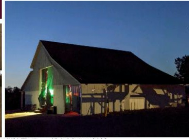
O'Neill's "Anna Christie" Sept. 2023