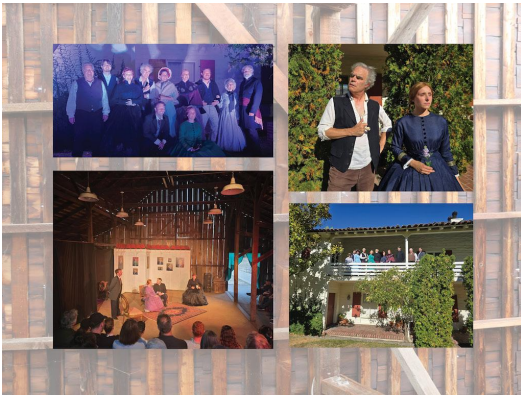
O'Neill's Mourning Becomes Electra where Tao House took center stage